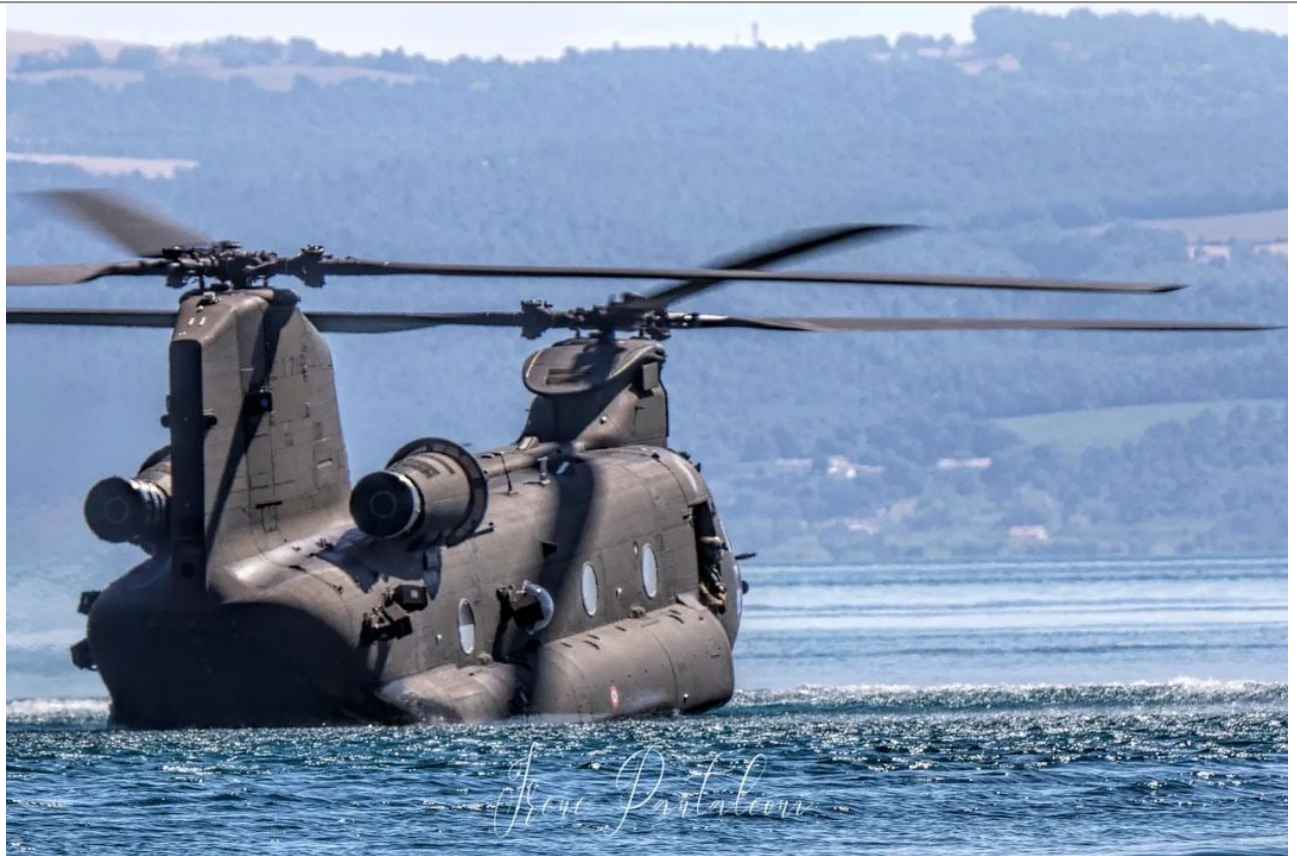
An Italian Boeing CH-47F practices special boat insertion techniques. Follow the Vertical page on Facebook.